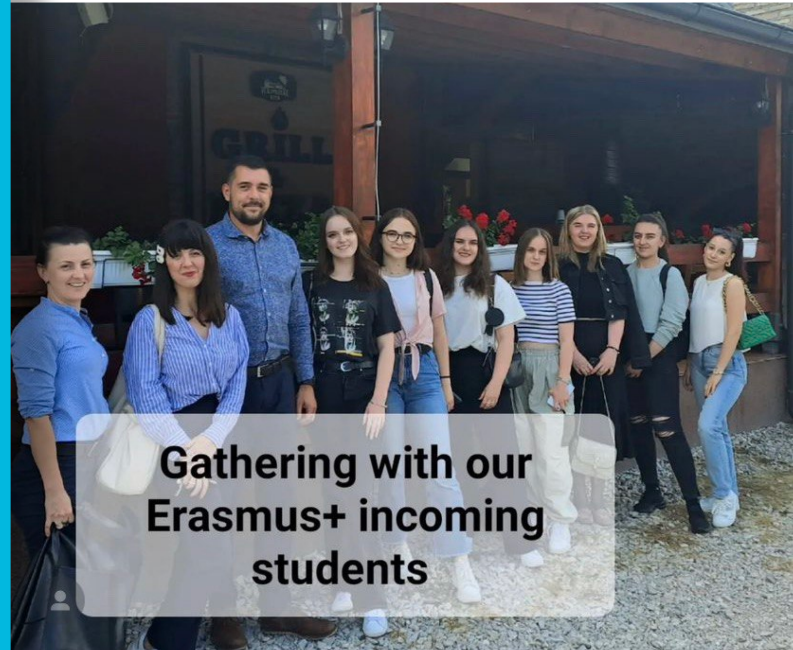
Gathering with our Erasmus+ incoming students

Attending lectures and classes in a foreign language was a challenge at first, but it also strengthened my language skills and improved my ability to communicate effectively. The diversity of perspectives in the classroom was eye-opening, as students from various countries brought their unique insights to discussions and debates. This exposure to different viewpoints broadened my horizons and enriched my academic experience.